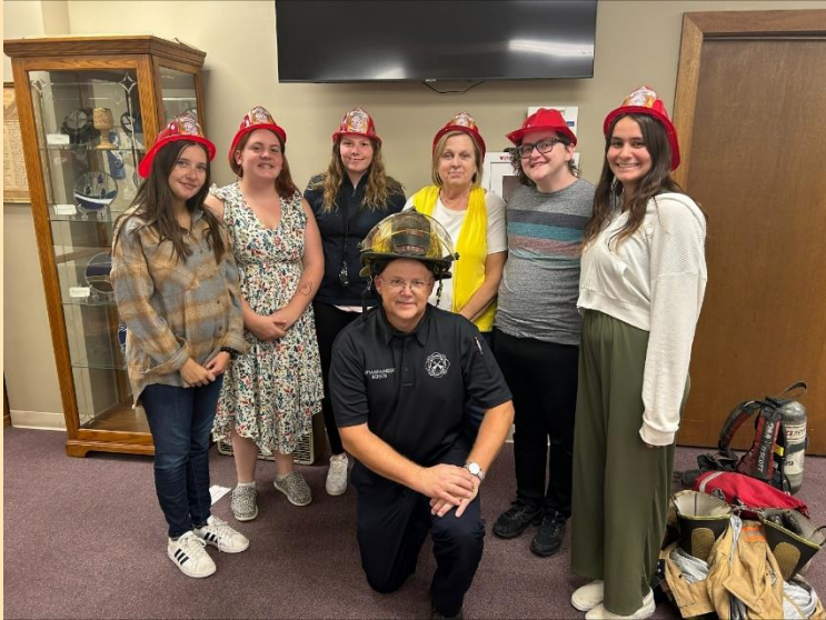
Council Bluffs Head Start and Early Head Start had the Council Bluffs Fire Department speak with families at the Family Night! Great learning opportunity for all!