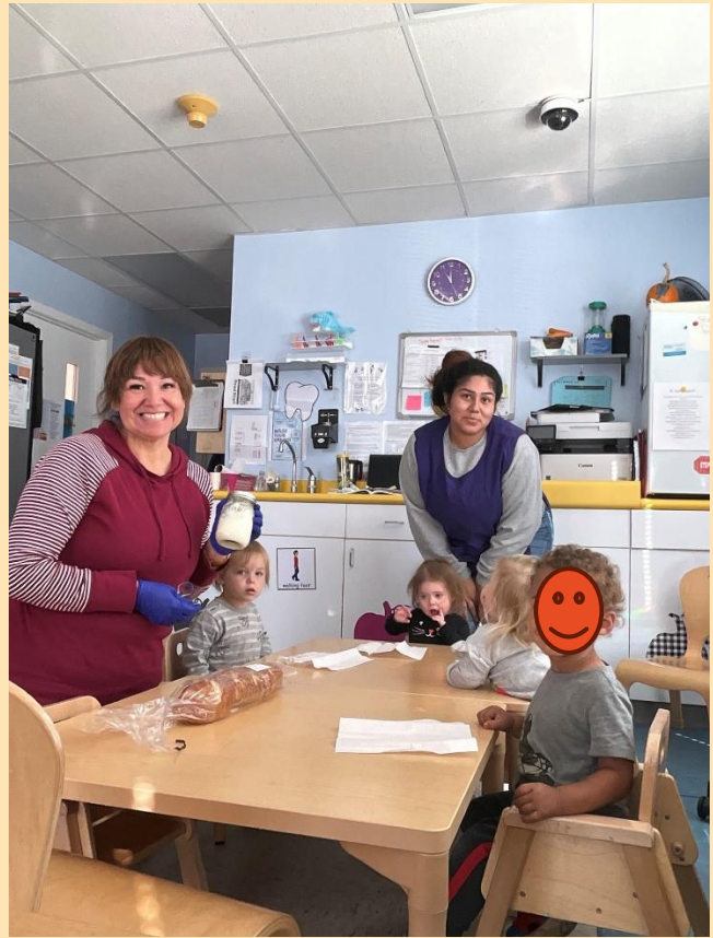
Red Oak Early Head Start made and TASTE their own butter! ☺