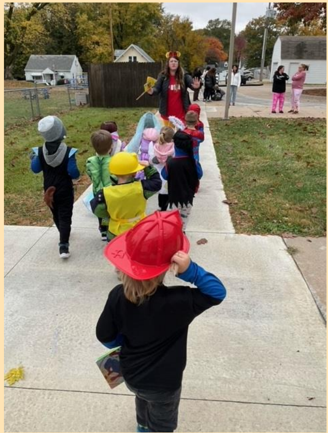
Red Oak children brought their favorite storybook and dressed up like a character from it! We had the police, Southwest Iowa Squadron of Heroes, and families join us in a walking/running parade around our circle drive!