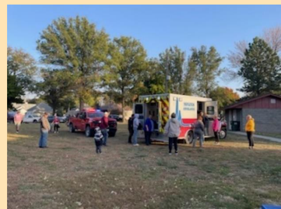
Mapleton Head Start celebrated by inviting a variety of first responders to their Family Night. Families got to go inside an ambulance and explore fire trucks!