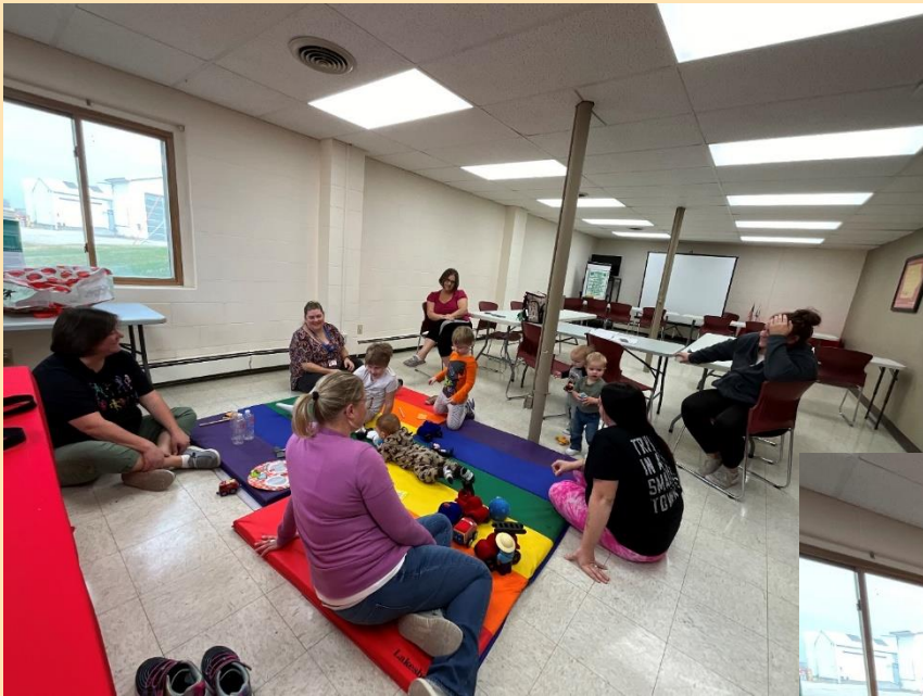
Home Base had great turn-out Socialization in Red Oak.