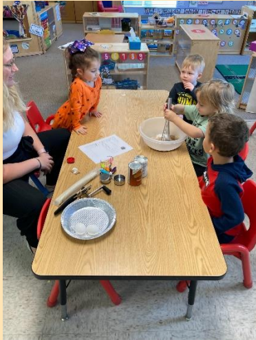
Red Oak Head Start baked and taste-tested their own pumpkins! Delicious!